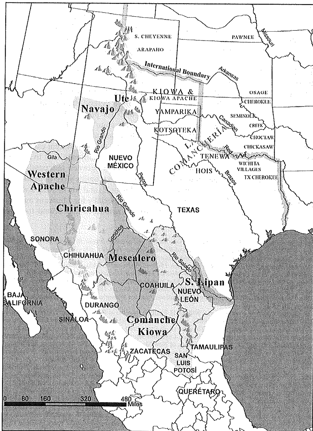
FIGURE 1: Approximate zones of conflict between independent Indians and Northern Mexicans, ca. 1844.